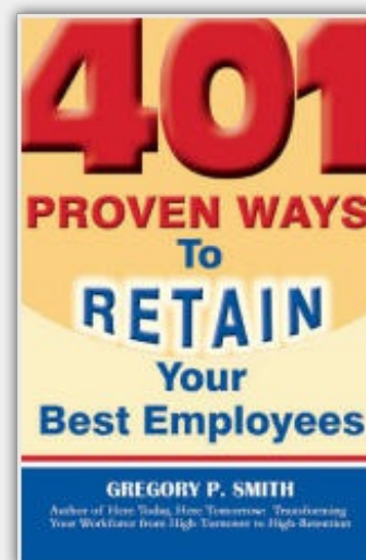
Chart Your Course International 2814 Highway 212 Conyers, GA 30094 770-860-9464 800-821-2487

SUBSCRIBE TO OUR FREE NEWSLETTER AND RECEIVE SEVEN FREE REPORTS